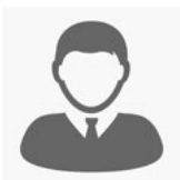
AL THURIAH GROUP Agent