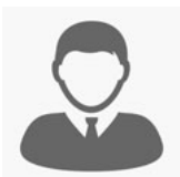
AL THURIAH GROUP Agent